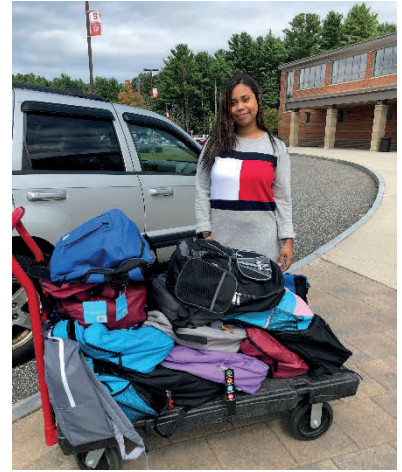
Dropping off Backpacks filled with supplies to Southbridge High School

With help of our community, each year Catholic Charities distributes Thanksgiving baskets and brand new Christmas toys to families and children in need during the holidays.