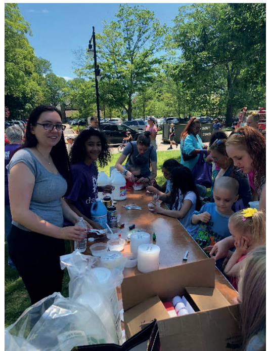
2019 Day of Play, playing games with children as we teach families about the services we provide