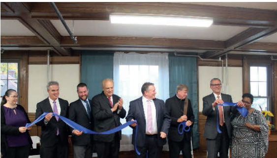
Cutting the ribbon at the new location of Catholic Charities Family Shelter