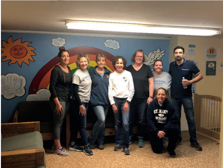
Teachers from St. Mary's School in Shrewsbury volunteering at Catholic Charities Family Shelter and packing for the move to Caroline Street, Worcester, MA

We welcome individuals of all ages and faiths to share their talents, skills and time. Volunteers enhance our programs, provide hope to those in need, and increase resources for the communities we serve. The following are examples of opportunities: picking up food from the Worcester County Food Bank, working with guests in our food pantries, sorting donations in our clothing closets, organizing diaper drives, collecting household items for our newly arrived immigrants, delivering and serving Thanksgiving and Christmas meals, and working with individuals with developmental disabilities. Please visit www.ccworc.org/volunteer-opportunities/ for more information.