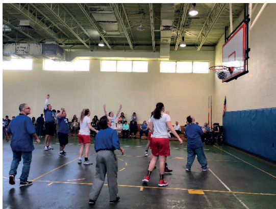
Mercy Centre Team scoring a basket against WPI Women's Basketball during the annual picnic