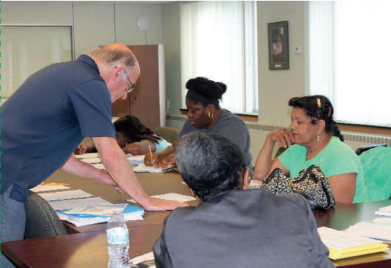
Students learning during ESL/Civics class

ESL (English as a Second Language)/Civics Classes are provided for any adult needing Basic English skills to further his or her education, increase employment opportunities, or as a prerequisite to our citizenship program.