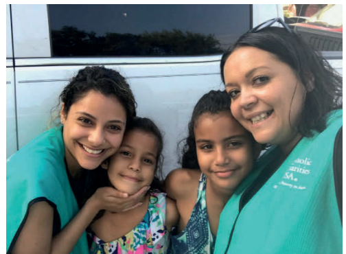
Assisting a family who recently arrived in Laredo, TX

Seven of our staff members teamed up with Catholic Charities USA to volunteer in Laredo, Texas and Yuma, Arizona to help migrants upon their arrival to the U.S. During our time volunteering, we drove migrants to the airport, looked after children, helped people make calls to their family, and assisted in setting up the clothing closet and food pantry.