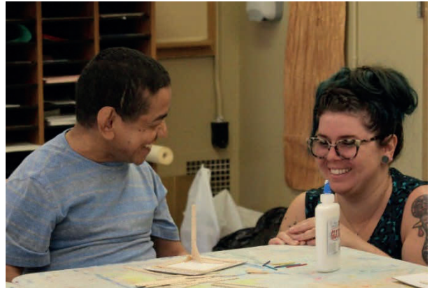
Art therapy at the Mercy Centre