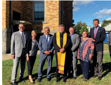
Ribbon Cutting Ceremony for the Women's Recovery Program

In October, we celebrated the grand opening of a brand new Women's Recovery Program. The program provides a 3-6 month women's residential program for the treatment of a substance use disorder and co-occurring enhanced disorder(s). The program, located in Leominster, MA, is the first to address a higher level of care in the area.