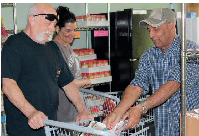
Food Pantry in Worcester, MA